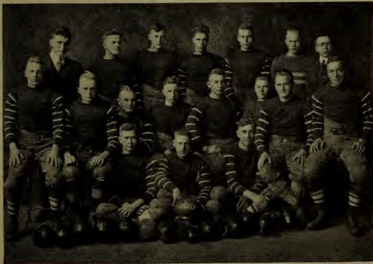
Foot Ball Team, 1919—20.

At the present writing spring foot ball practice is being taken by a large squad of candidates.